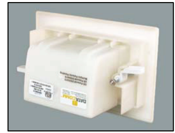
45-0008 – Back View