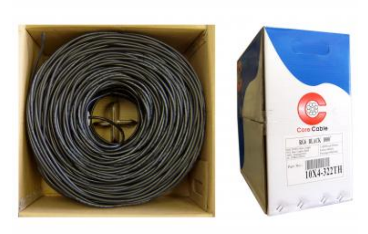
RG6 18AWG, Solid Pure Copper Coaxial Cable, 95% Copper Braid