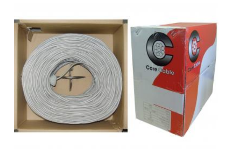
22/4 (22AWG 4C) Stranded CM Security Cable