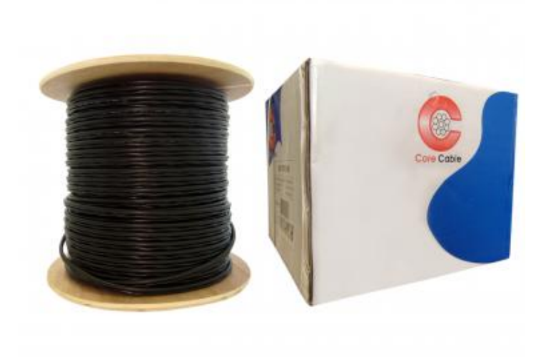
RG59 Siamese Coaxial Cable, Solid + 18/2 Power, Outdoor / Direct Burial, Black