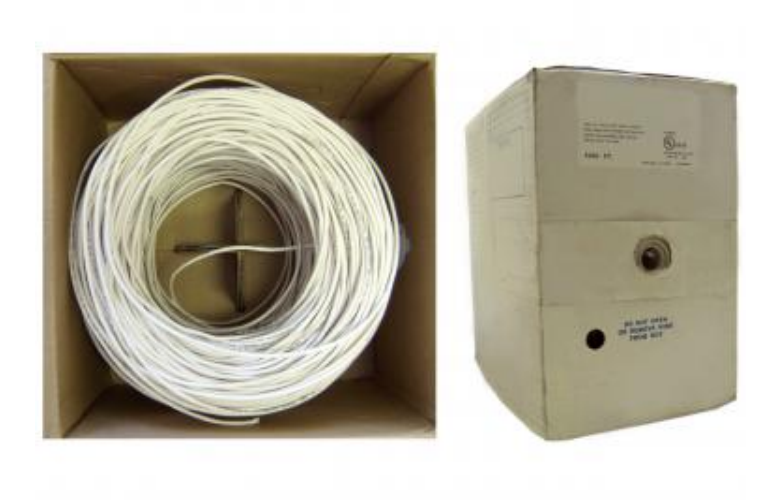
18/2 (18AWG 2C) Plenum Shielded Stranded CMP Security Cable, White