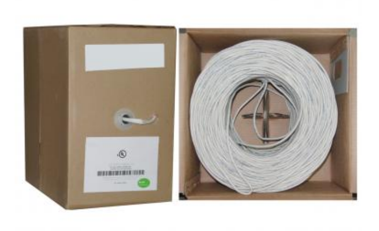
14/2 (14AWG 2C) 105 Strand/0.16mm Speaker Cable CL3 Rated