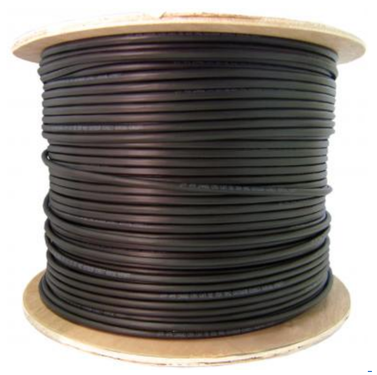
CAT5E, CMXT Outdoor / Direct Burial, Waterproof Tape