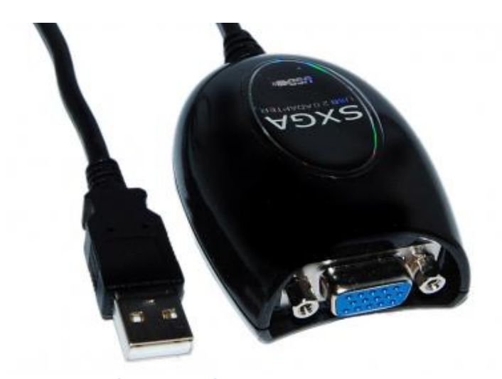
USB 2.0 to VGA Dual Monitor Adaptor

Our final highlighted conversion for this edition is a USB to Ethernet converter. Do you have a computer/laptop with no Ethernet port and spotty wireless coverage? Well then this doohickey can save the day. Perhaps you have a system with an included network card but you now find yourself needing a second Ethernet port. Again, this device comes to the rescue. With this part you can easily add Ethernet capability to any computer, laptop or netbook that has a USB port.