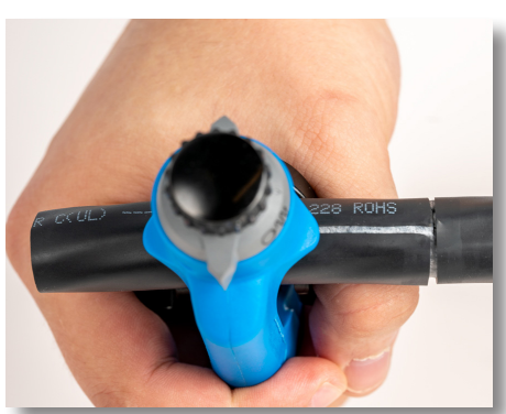
The CST-1140 Round Cable Strip & Ring Tool is designed for fast and precise removal of cable jackets from round cables that are 3/16" to 1 1/8" (4.5 mm-29 mm) in diameter. This round cable stripper features the following: